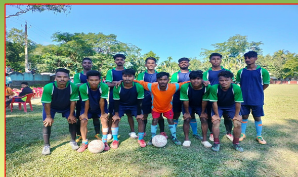
Amguri College football team