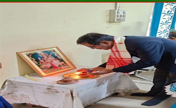
Opening of CMA centre